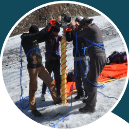
Ice core drilling at Machoi

Machoi glacier located in the Ladakh region has been chosen for imparting field training on various aspects of glaciology and instrumentation use to the school participants. The glacier is about 6 Sq. km in area and is situated in the Drass sub-basin, about 26 km from Sonamarg, the major tourist attraction in the Kashmir valley. The Drass River originating from the melt-waters of the Machoi Glacier joins the Suru River at the Kargil town. The Glacier, facing north, has a mean altitude of ~4600 m asl and the slope ranges from 1° – 60° with a mean value of 21°. The glacier is being monitored by the University of Kashmir since 2013 for various aspects including length and area changes, mass balance, ice thickness using state-of-art instrumentation and earth observation data.