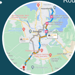
Airport-TRC to KU