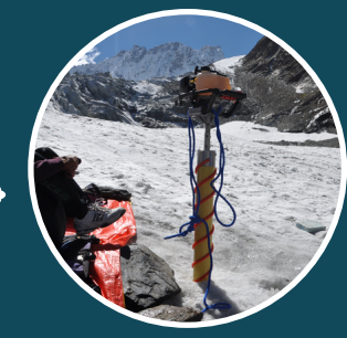
Ice core drill