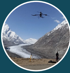
Unmanned Aerial Vehicle