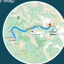
KU to Machoi Glacier