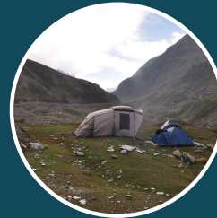
Machoi Base Camp