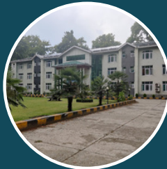
KU, Guest House

University Guest House in the main campus University of Kashmir which is situated at Hazratbal, Srinagar. It is flanked by the world famous Dal Lake on its eastern side and Nigeen Lake on the western side. The Main Campus of the University spread over 247 acres of land is divided into three parts – Hazratbal Campus, Naseem Bagh Campus and Mirza Bagh Campus (serving residential purpose). The tranquil ambience of the Campus provides the right kind of atmosphere for serious study and research. The participants in the program will be accommodated in Guest house during the theoretical part of the program. However, during field work at the Machoi glacier, the participants will be accommodated on sharing-basis in nearby hotels in Drass for a few days and also in the tents pitched at the base camp of the Machoi glacier or in the vicinity.