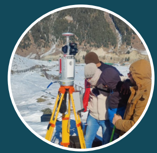
Terrestrial laser scanner