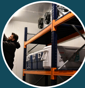
Ice core freezer